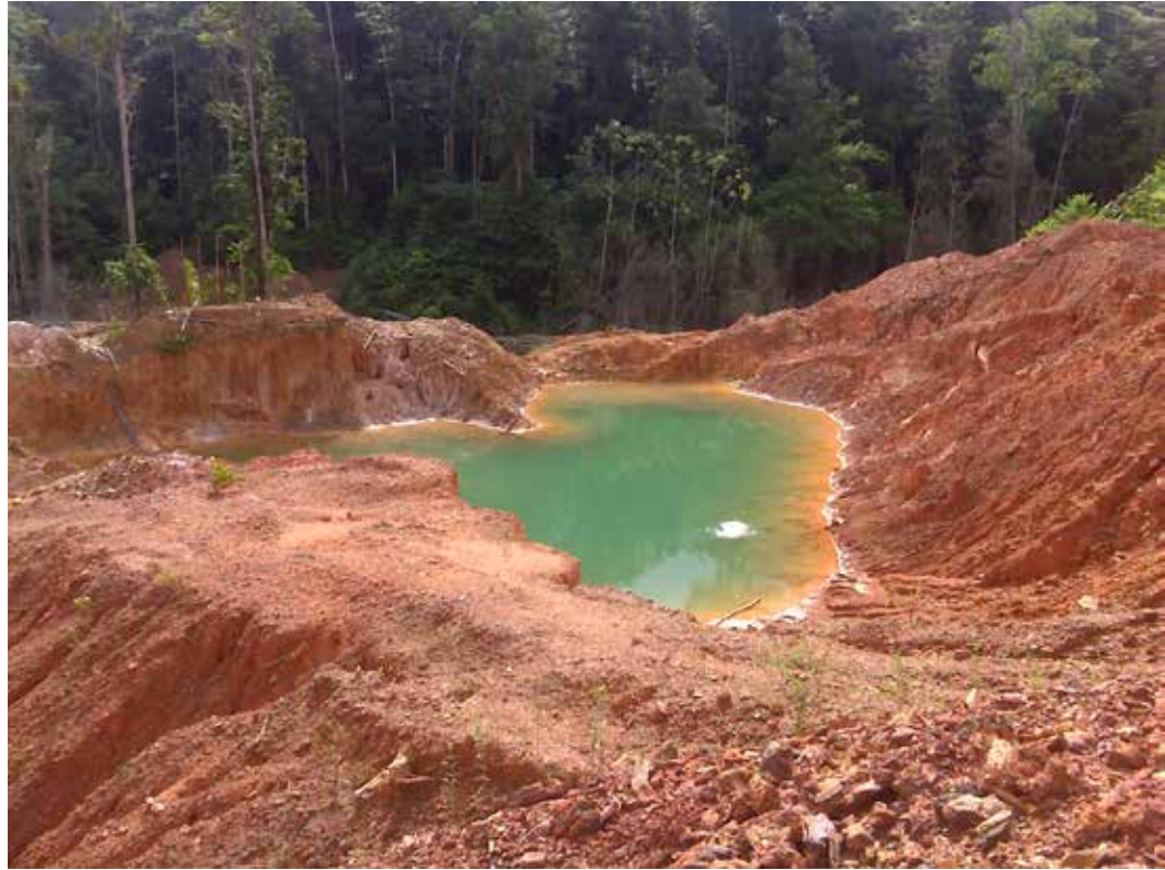
Figure 21-4 Cyanobacterial bloom in abandoned ASM pit